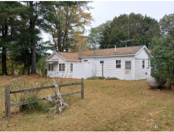
Smallwood Lake Cabin

MLS # 50125574 Address 75 Lakeview Drive Area (Municipality) Hay Twp (26011) Mail City Gladwin County Gladwin State MI Zip 48624 Class RESIDENTIAL Type Single Family Sale/Rent For Sale Status Active Asking Price $84,987