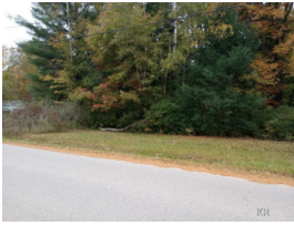
Extra Lots Across Street

This information is deemed reliable, but not guaranteed. All room dimensions are in appx. feet.