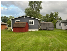
Back of house