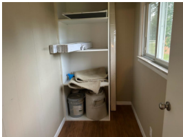
Large closet off Dining a