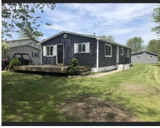
Front of house

MLS # 50116130 Address 211 W Glidden Road Area (Municipality) Beaverton (26016) Mail City Beaverton County Gladwin State MI Zip 48612 Class RESIDENTIAL Type Single Family Sale/Rent For Sale Status Active Asking Price $115,000